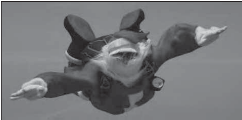
Figure 1: Parachute exit

The free fall position must take in consideration all interferences between the pilot's barb and the opening mechanism (See figure 1)